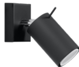
Kinkiet | wall lamp Ring 1 SL.0091