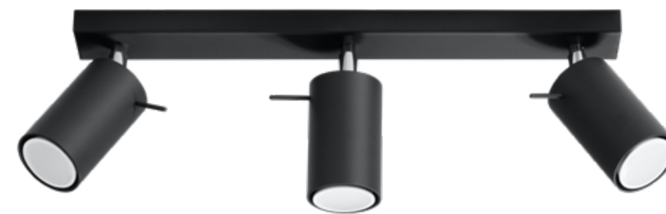
Plafon | ceiling lamp Ring 3 SL.0093