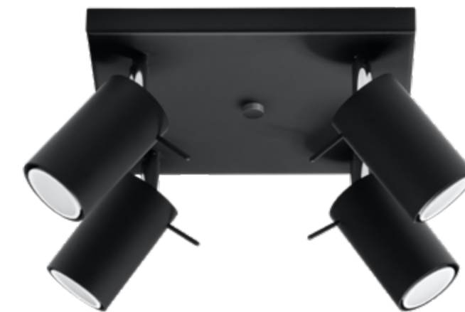
Plafon | ceiling lamp Ring 4 SL.0094