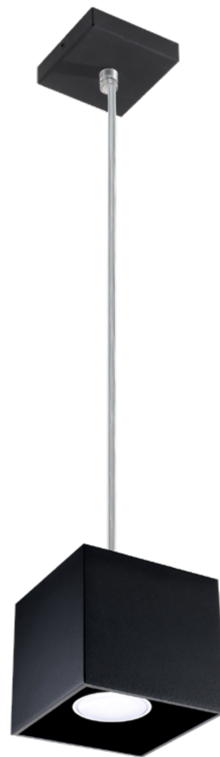
Lampa wisząca | pendant lamp Quad 1 SL.0060