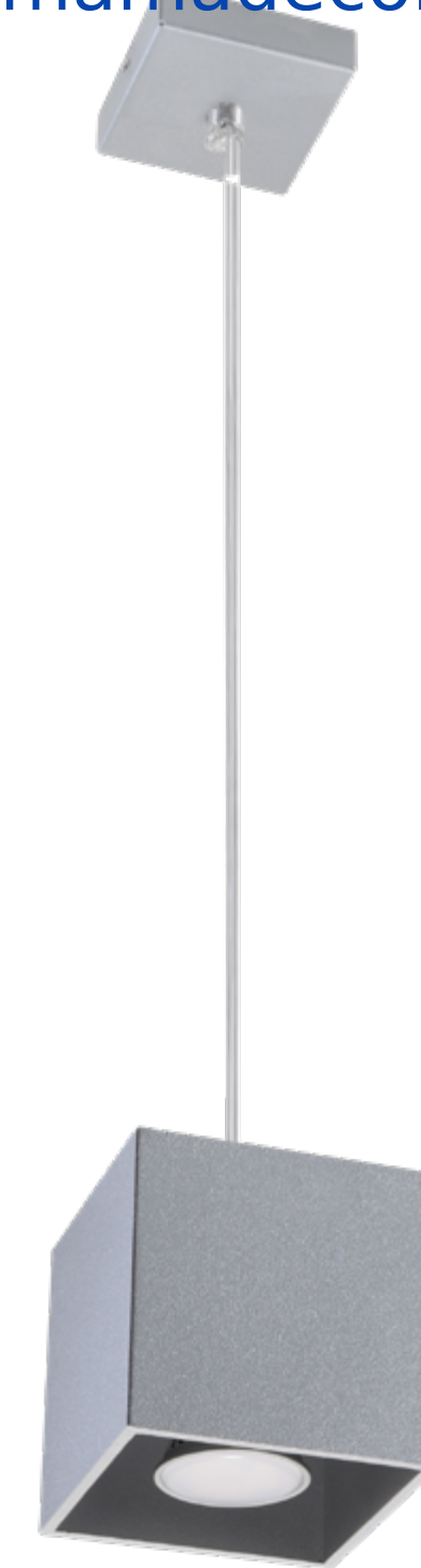
Lampa wisząca | pendant lamp Quad 1 SL.0061