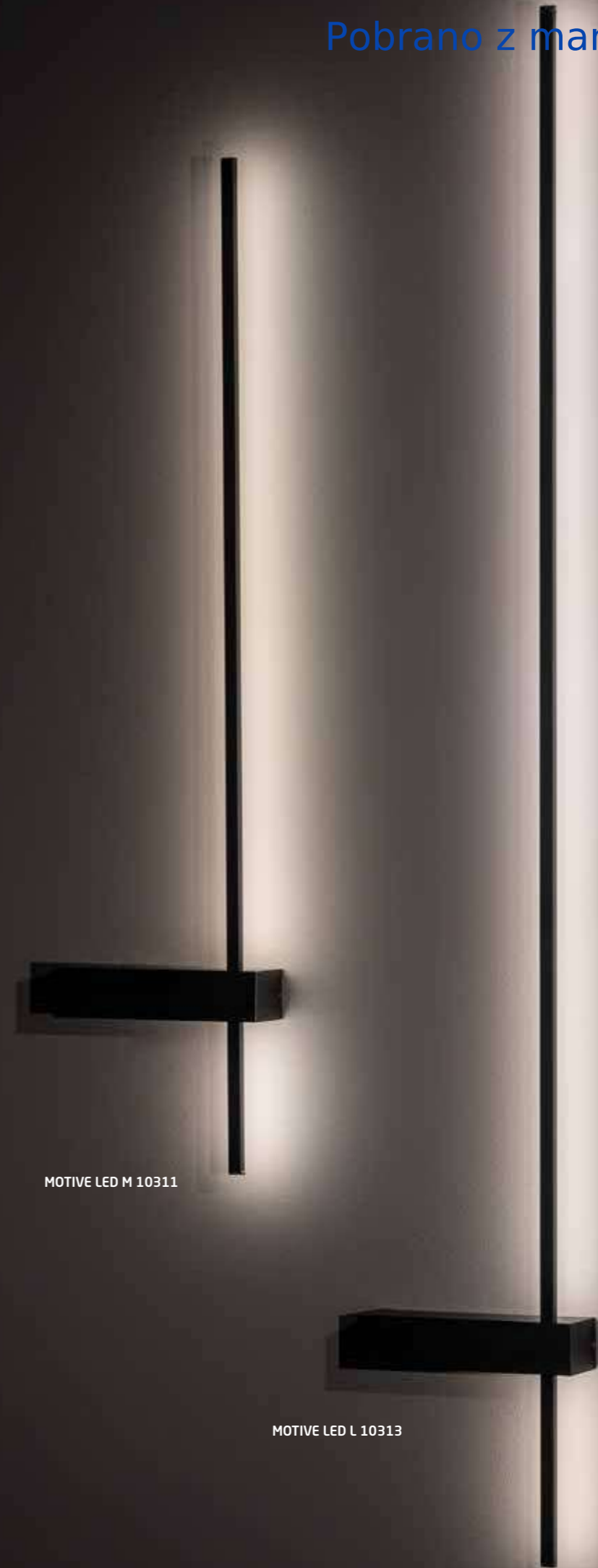
MOTIVE LED M 10311