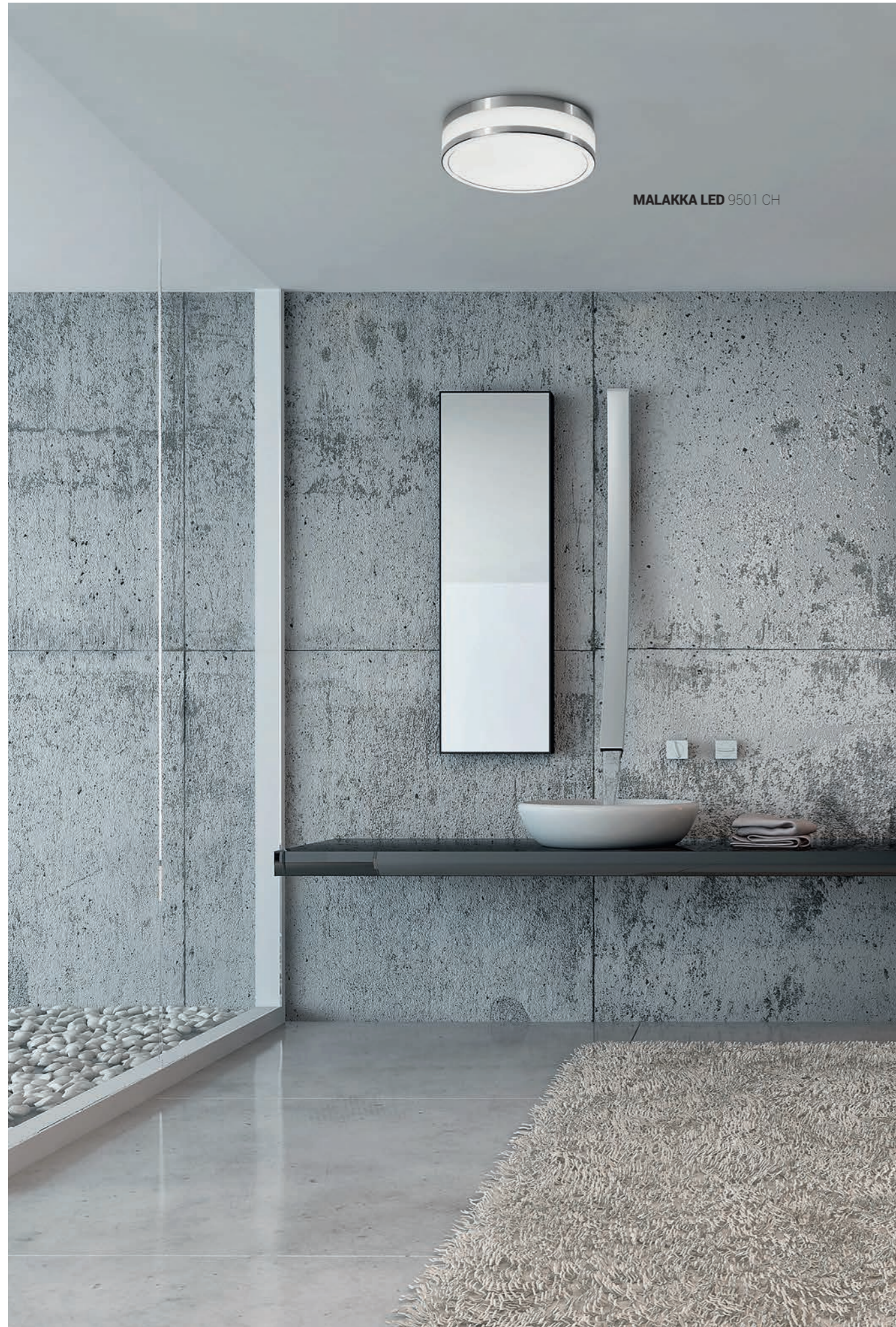
MALAKKA LED 9501 CH