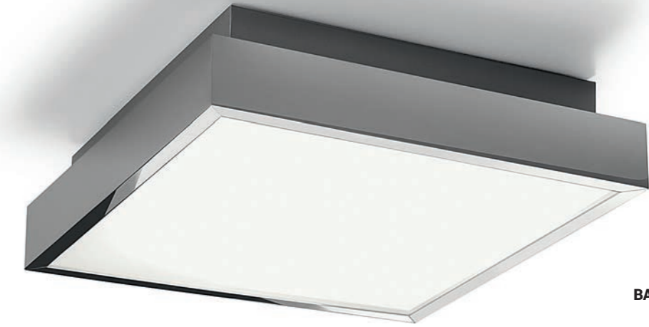
BASSA LED 9500 CH