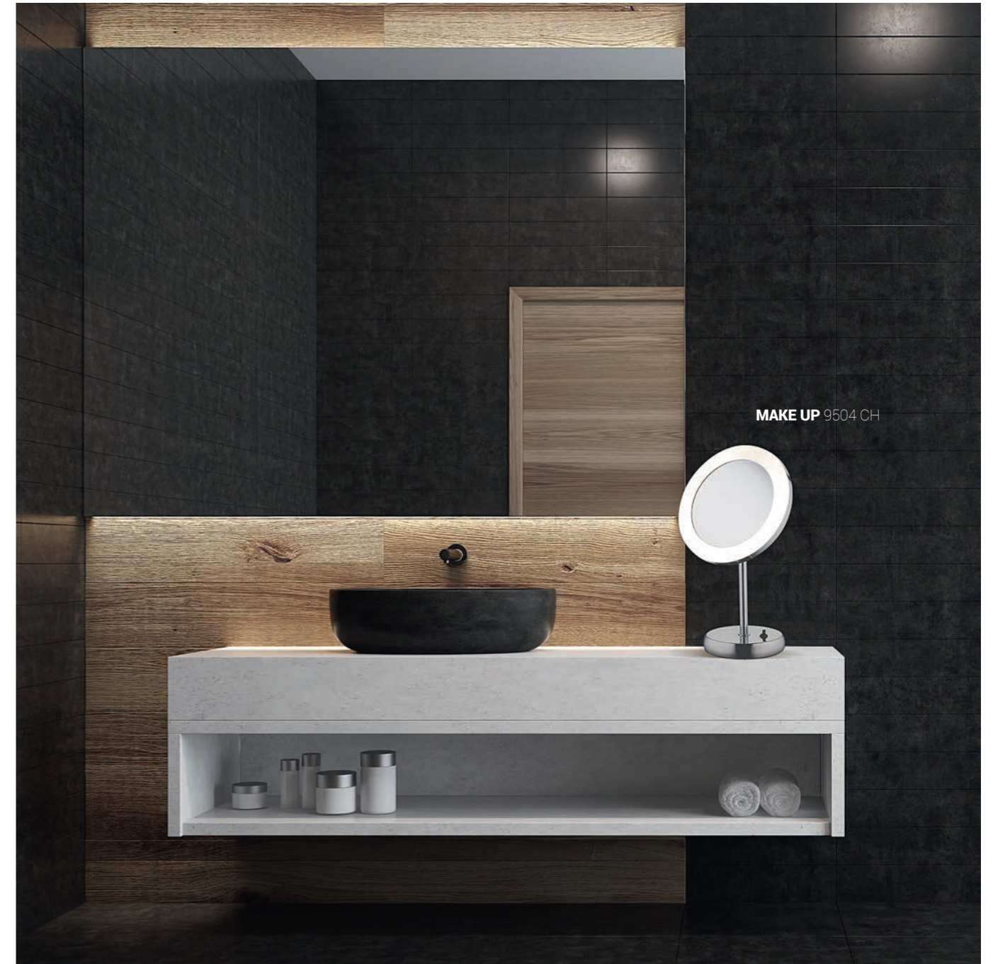
MAKE UP 9504 CH