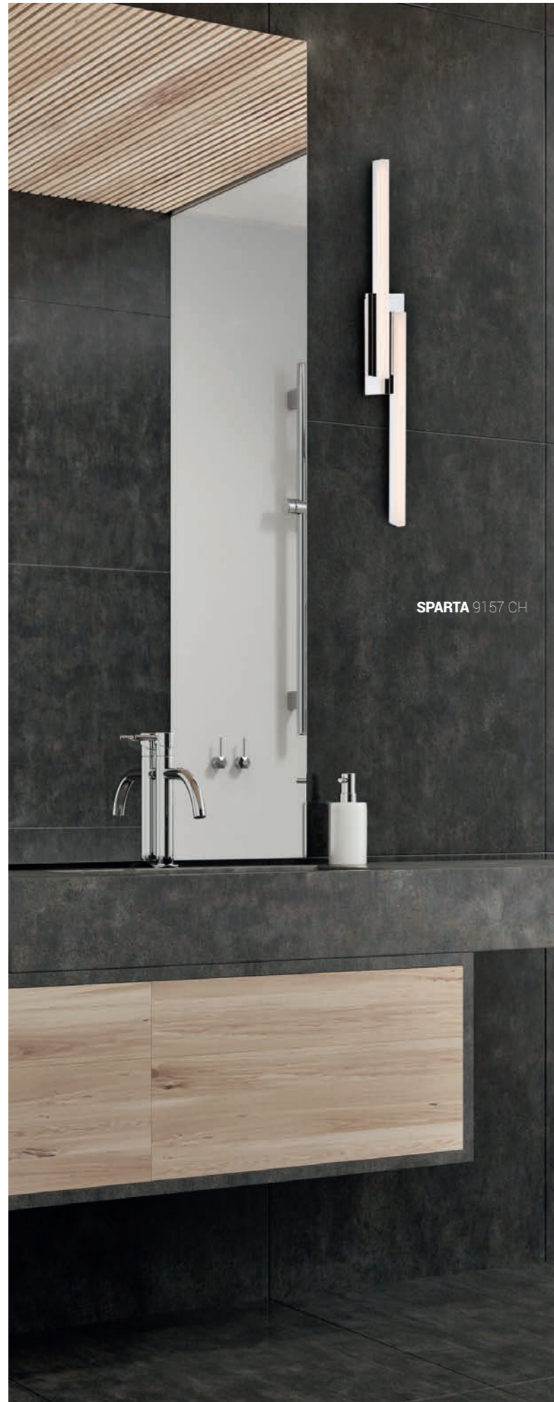
SPARTA 9157 CH