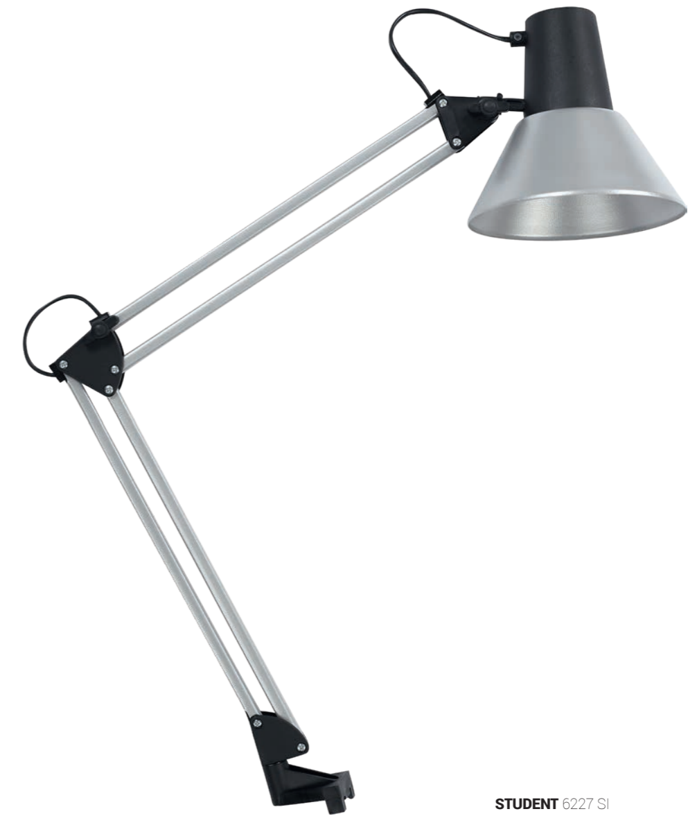
STUDENT 6227 SI