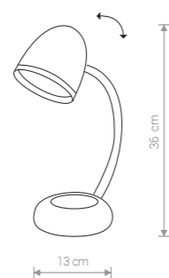
POCATELLO 5795 SI