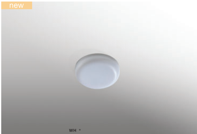
LAMIR R 9 IP44 3000K / 4000K