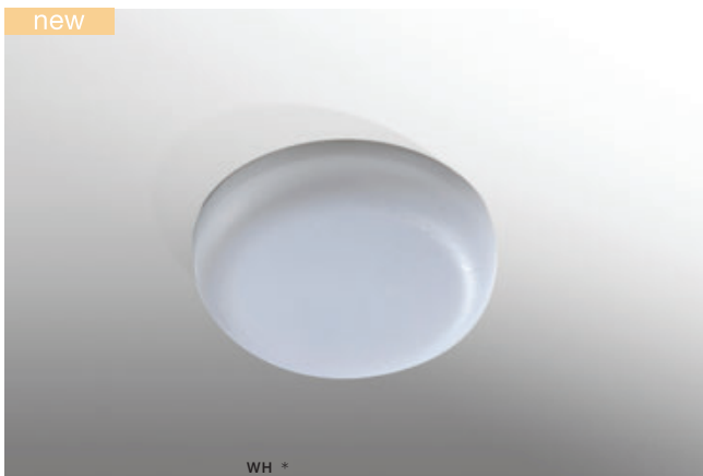
LAMIR R 17 DIMM IP44 3000K / 4000K