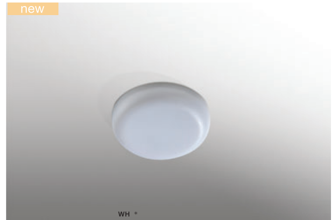
LAMIR R 12 IP44 3000K / 4000K