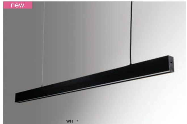
LINNEA 140 PENDANT CCT