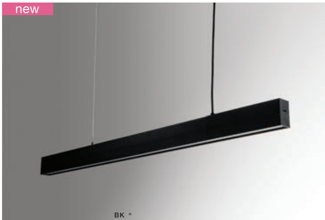
LINNEA 112 PENDANT CCT