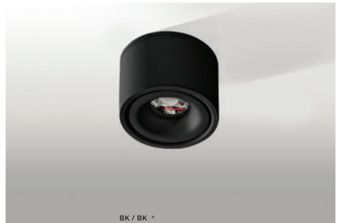
BK / BK *