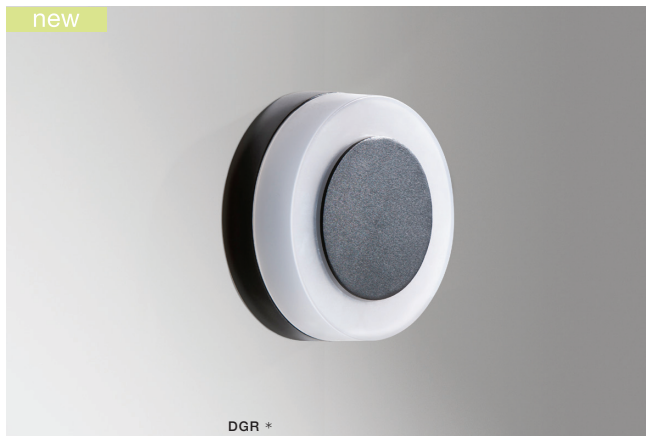
ENOK ROUND WALL 3000K