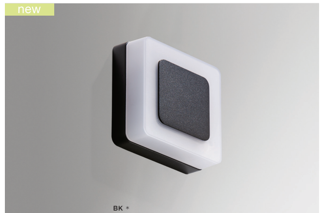
ENOK SQUARE WALL 3000K / 4000K